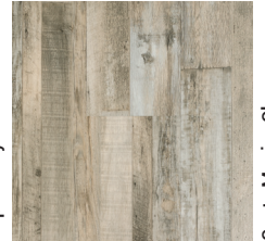
Santa Monica Shores