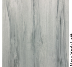
New York Loft